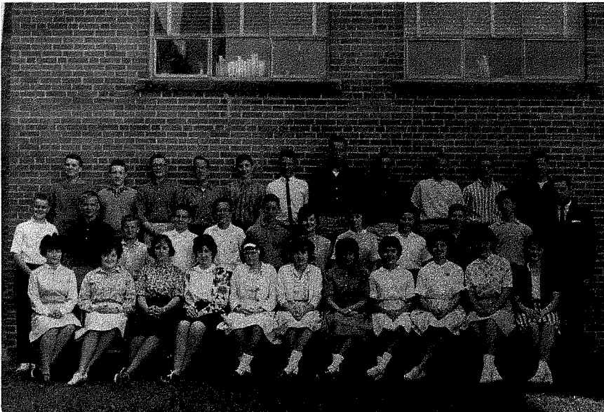
HOME ROOM 212