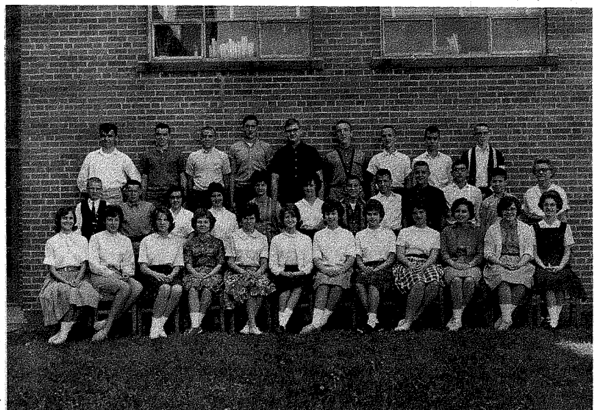
HOME ROOM 207