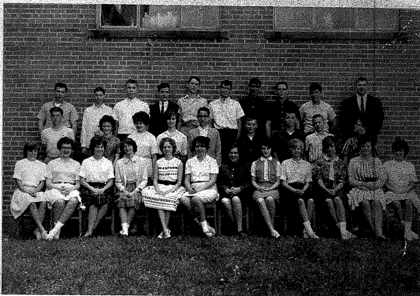
HOME ROOM 204