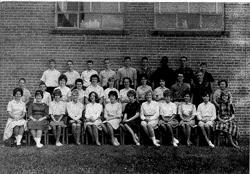
HOME ROOM 113