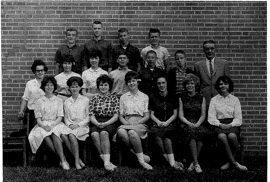
HOME ROOM 20