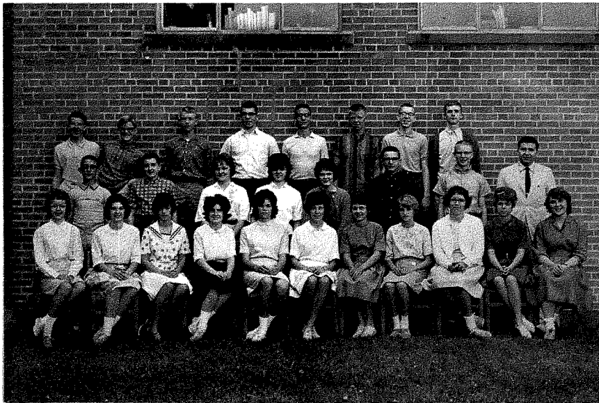
HOME ROOM 206