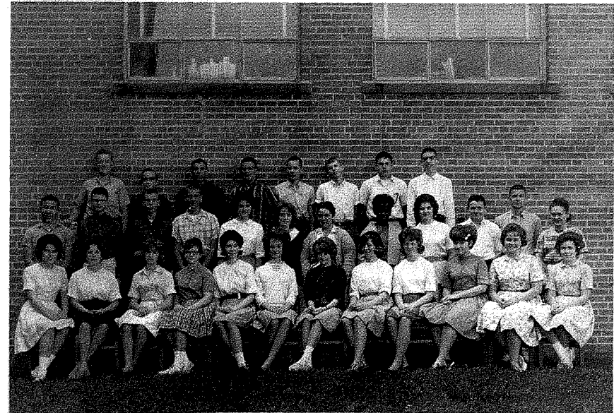
HOME ROOM 10