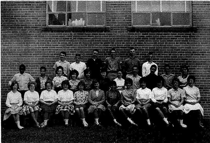
HOME ROOM 202A