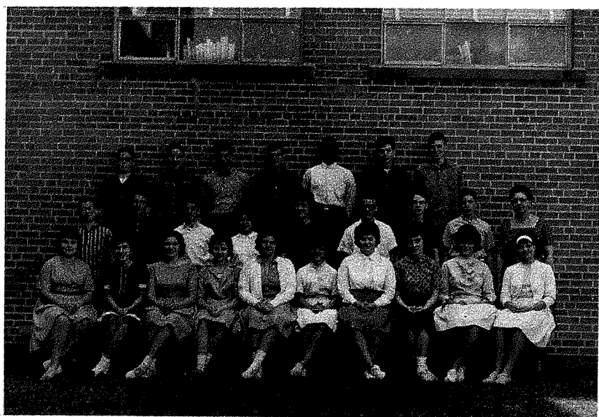
HOME ROOM 209