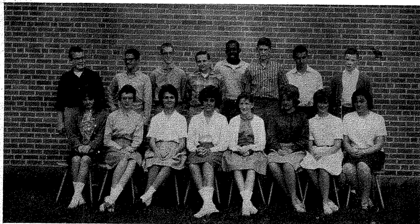
Students who were absent when first pictures were taken